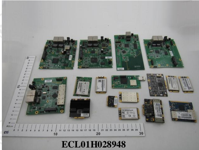
Final product (The same material)